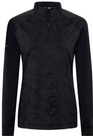
WOMEN'S AMETHYST - JH20L XS - XL

US $80(A) CDN $90(A) 92% Polyester, 8% Spandex