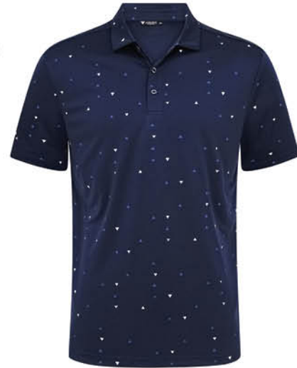
MEN'S CONFETTI - PM6BL S - XXL