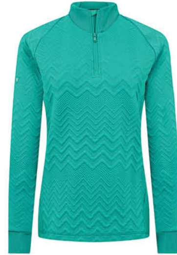
WOMEN'S AFTERGLOW - JO20L S - 3XL

US $90(A) CDN $100(A) 97% Polyester, 3% Spandex