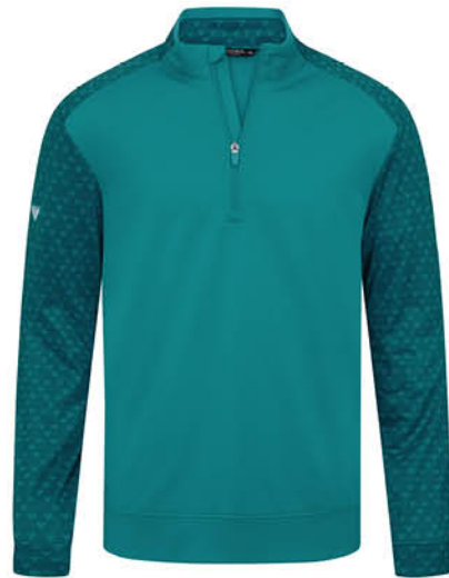
MEN'S AZTEC - IS60L S - 3XL