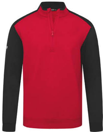
MEN'S BAYOU - JT58L S - 3XL

US $80(A) CDN $90(A) 92% Polyester, 8% Spandex