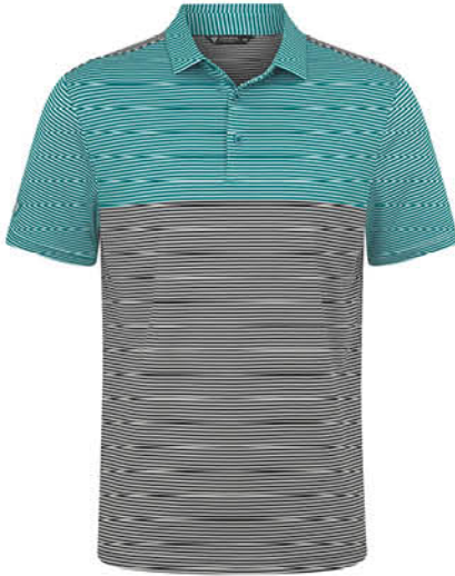
MEN'S ARUBA - YD62L S - XXL

US $80(A) CDN $90(A) 92% Polyester, 8% Spandex