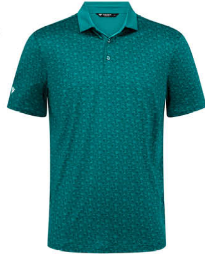
MEN'S ASH - YE68L S - XXL

US $70(A) CDN $80(A) 92% Polyester, 8% Spandex