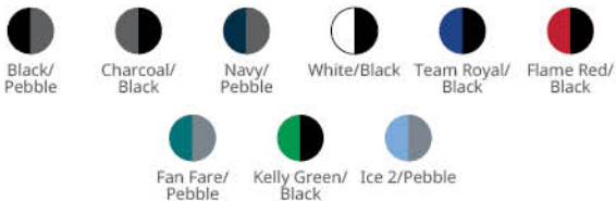
Black/Pebble Charcoal/Black Navy/Pebble White/Black Team Royal/Black Flame Red/Black Fan Fare/Pebble Kelly Green/Black Ice 2/Pebble