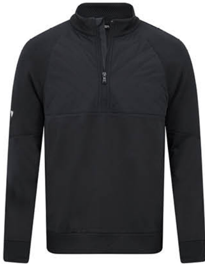
MEN'S ATLANTIC - JV50L S - 3XL

US $110(A) CDN $120(A) 97% Polyester, 3% Spandex Fill: 100% Polyester