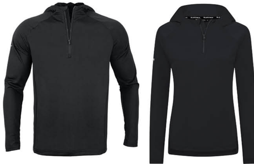
ZANDER - LK51L S - XXL / RAVEN - LK00L XS - XL

Men's - US $75(A) CDN $85(A) 100% Polyester / Women's - US $70(A) CDN $80(A) 100% Polyester