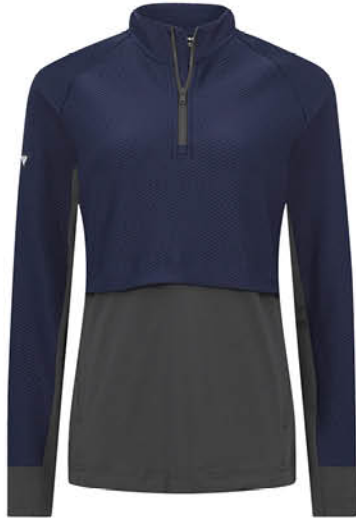
WOMEN'S MYSTIC - TH20L XS - XL

US $110(A) CDN $120(A) 93% Nylon, 7% Elastane