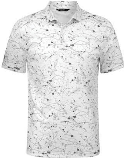
MEN'S SPLASH - PM5BL S - XXL