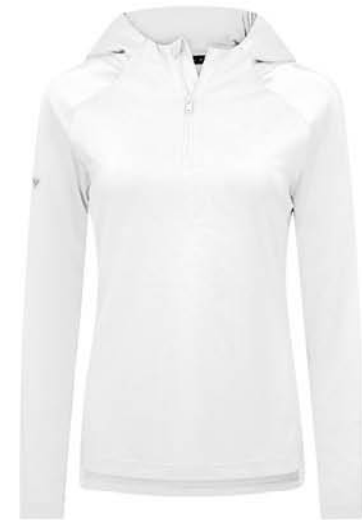
WOMEN'S RAVEN - LK00L XS - XL