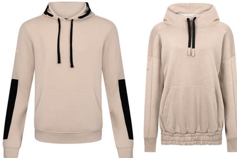
BOMBAY - CN50L S - 3XL / WATERFALL - RC13L XS - XXL

Men's - US $75(A) CDN $85(A) Women's - US $80(A) CDN $90(A) / 55% Cotton, 45% Polyester