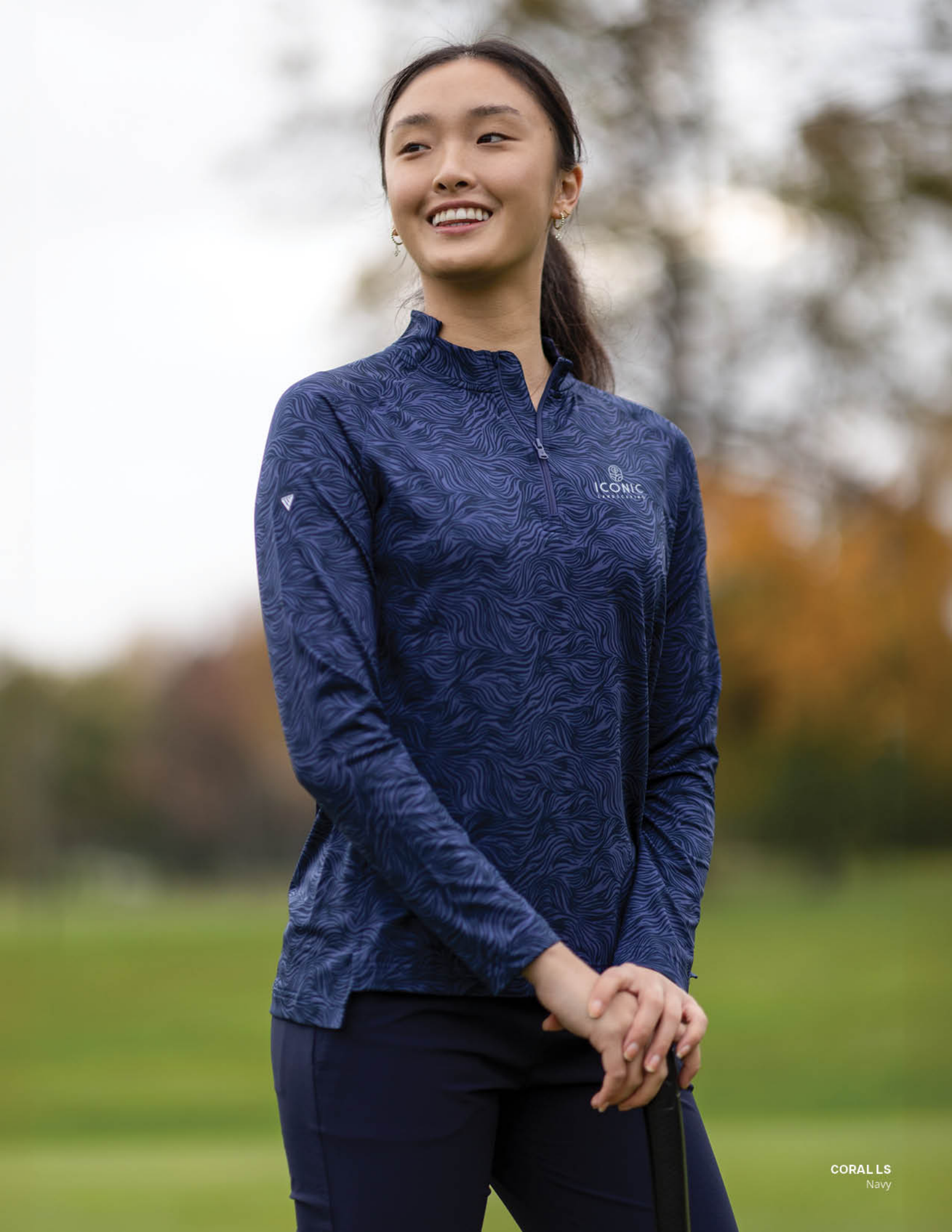
CORAL LS Navy