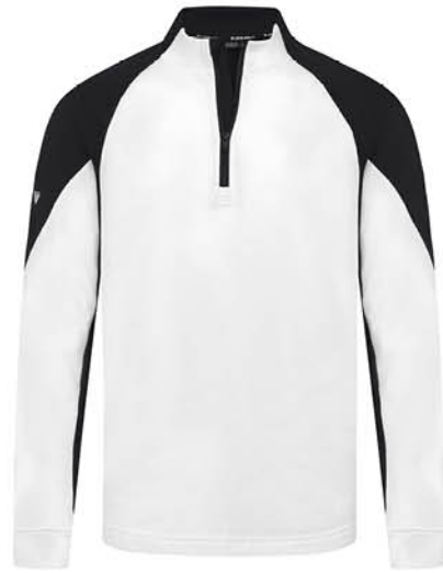
MEN'S CADET - JT78L S - 3XL

US $80(A) CDN $90(A) 88% Polyester, 12% Spandex