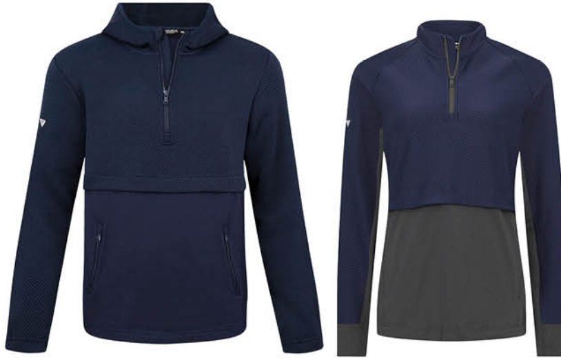
ARCADIA - JV51L S - 3XL / MYSTIC - TH20L XS - XL

Men's - US $120(A) CDN $130(A) 97% Polyester, 3% Spandex / Contrast: 91% Polyester, 9% Spandex